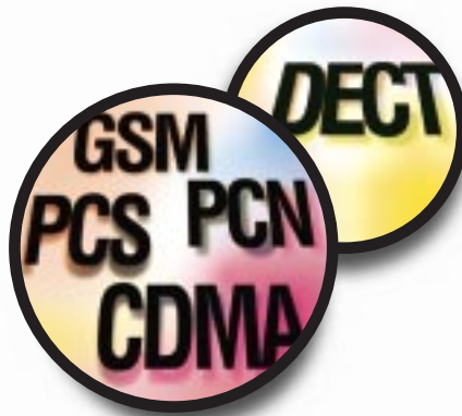
STABILOCK 4032, the universal communication platform

The STABILOCK 4032 Series meets the needs of service organizations and mobile radio manufacturers worldwide. With over 7 major digital systems and over 30 analog formats available, universal coverage of radio systems is provided.