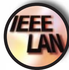
Flexibility for automated testing

Fast measurement combined with accuracy provides an ideal solution for manufacturers of digital radio terminals. GPIB programming or connection to a LAN server allow flexibility in automated testing. Programming measurements is easy using the AUTORUN feature. Editing on a PC with the ARE software package allows programs to be rapidly created or modified from the extensive Wavetek library.