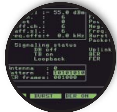
DECT: Portable part test screen