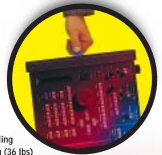
Convenient handling at less than 20 kg (36 lbs) weight

Numeric display provides simple analysis of channel, adjacent and alternate adjacent channel power levels.