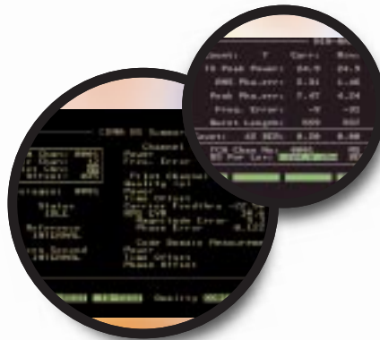
Digital measurements with an easy to read analog feel

The fast Spectrum Analyzer (up to 2.3 GHz) provides in- and out-of-band measurements for identifying spurious signals or intermodulation products. Optional tracking generator provides cable fault indication.