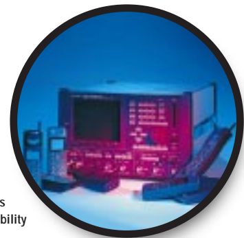
Modularity provides universal test capability